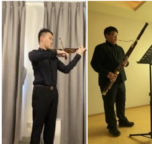
Stringed Instrument Performance Wind Instrument Performance